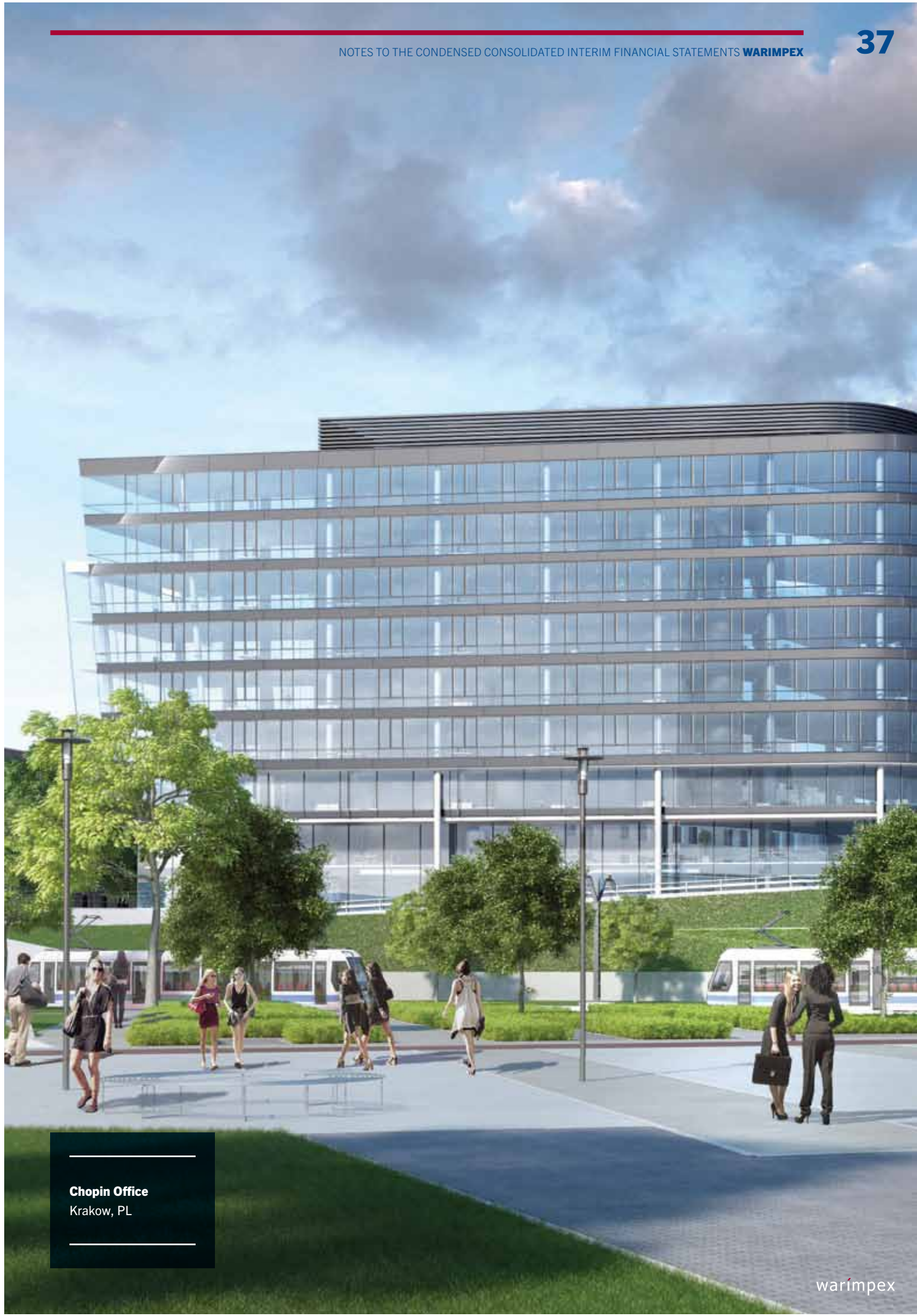
Chopin Office Krakow, PL