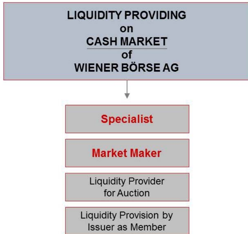
Figure: Liquidity Providing of Wiener Börse AG

This document represents a comprehensive overview about the liquidity providing as specialist and market maker.