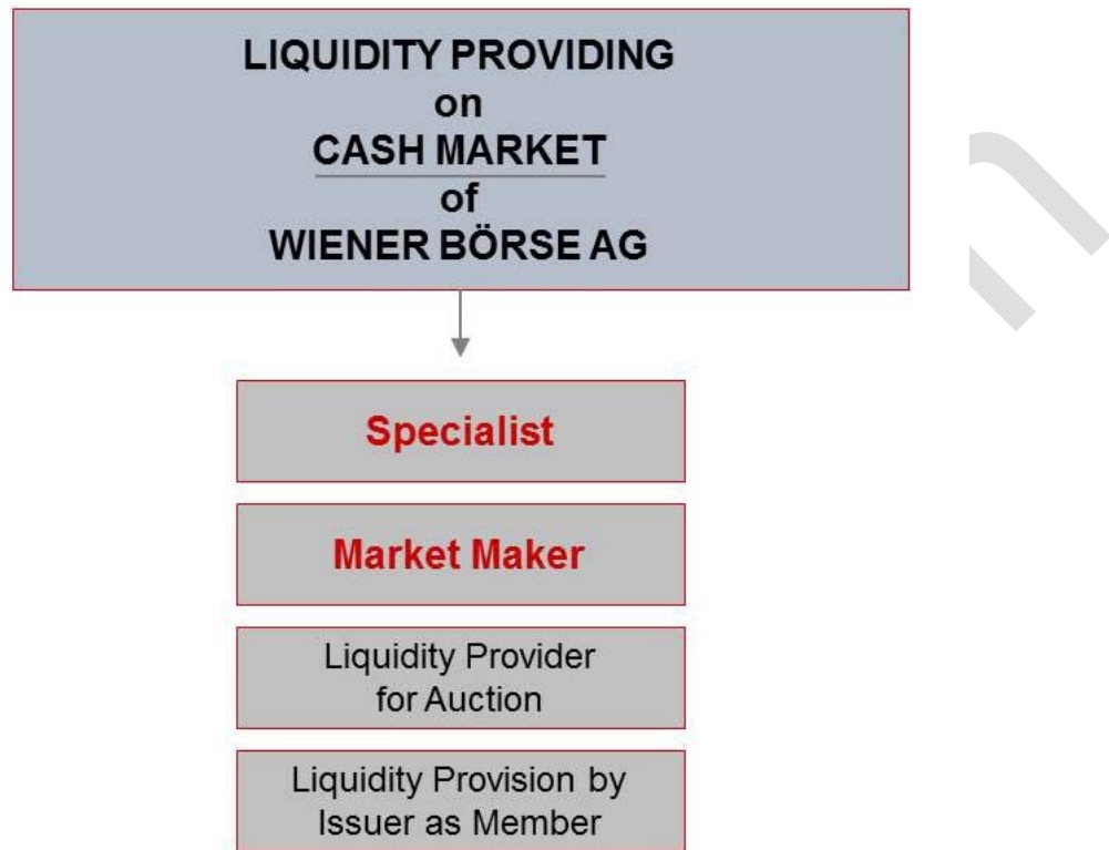
Figure: Liquidity Providing of Wiener Börse AG

This document represents a comprehensive overview about the liquidity providing as specialist and market maker.