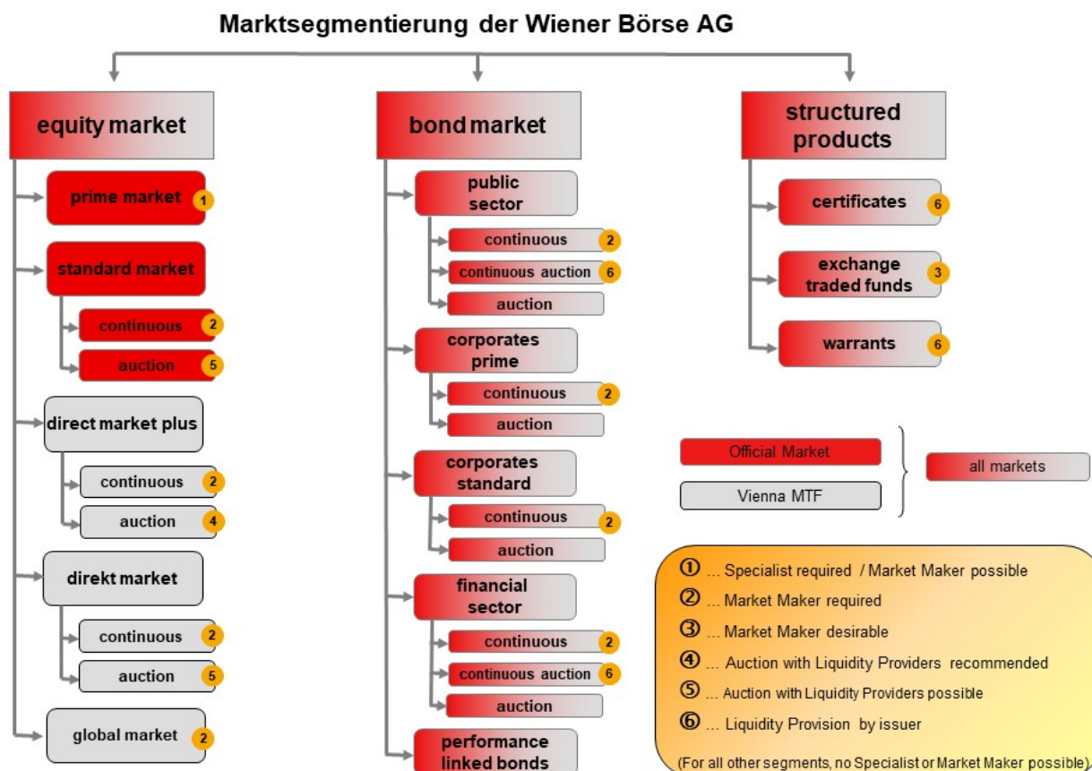
Figure: Market Segmentation of Wiener Börse AG

The financial instruments traded on the markets of Wiener Börse AG are grouped into the following segments: