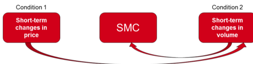
Figure: Market conditions for SMC

SMC occurs as soon as both market conditions - short-term price and volume changes - are met