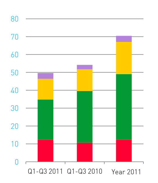
Revenue by geographical markets in € m

Overall SW Umwelttechnik has successfully adjusted to the changed market situation; the lean cost structure and the implemented restructuring measures have led to the expected improvements, which are reflected in the gross earnings.