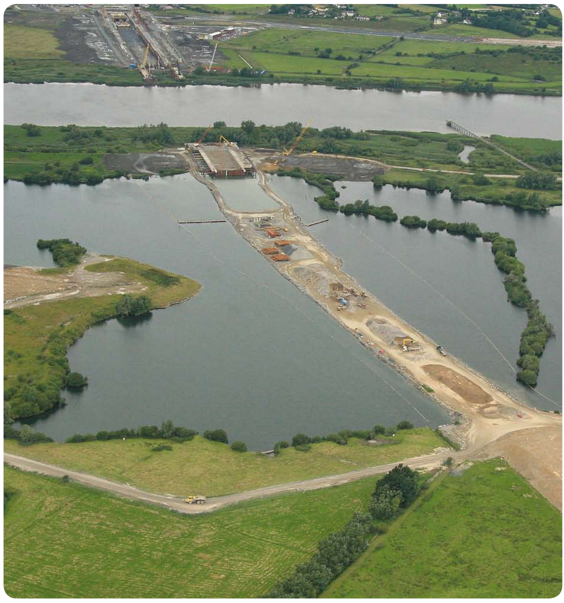
Limerick Bypass, Ireland