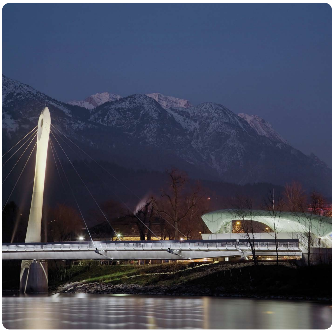
Nordkettenbahn, Hungerburgbahn, Innsbruck, Austria

Goodwill assets are subject to an annual impairment test in accordance with IAS 36. The impairment test is carried out in the last two months of the financial year. Effective 31 March 2008, there was no indication that goodwill impairment was necessary.