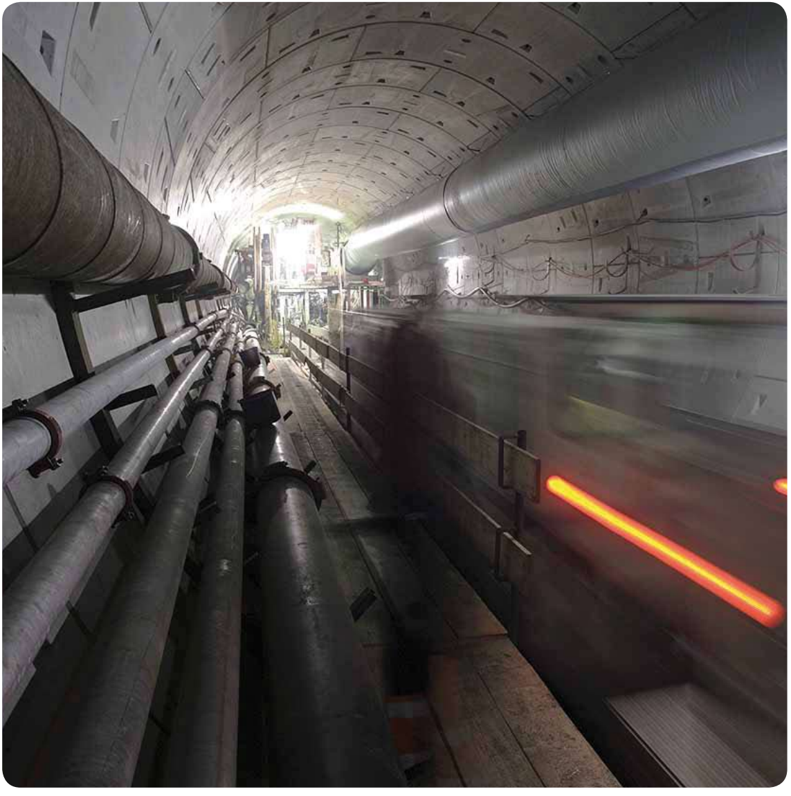
Staten Tunnel Randstad, Rotterdam, Netherlands

The Tunnelling Business Unit is currently preparing to bid for projects in Switzerland, Austria, Italy, Ireland, Belgium and Sweden, among other places. The management expects that the generally low price level in tunnelling in the core markets can be balanced out by the higher margins in STRABAG's newer markets such as Scandinavia. STRABAG's Infrastructure Development Business Unit is preparing a bid for Phase II of the M6 motorway in Hungary and for the construction of the A1 motorway in Poland with a total volume of over € 3 billion. STRABAG sees great opportunities in this area, as several other tenders have already been announced. In PPP Real Estate, the STRABAG Group is currently pre-qualified for construction projects worth about € 350 million, while bids for a further € 327 million are outstanding. Particularly in Germany, STRABAG sees a positive situation in terms of demand.