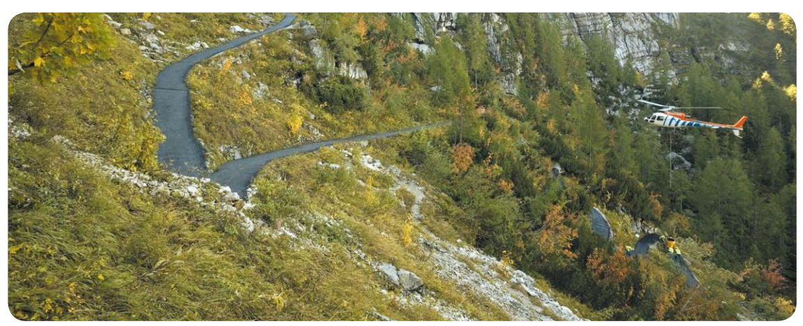
Bituminisation entry cavern system, Dachstein, Upper Austria, Austria