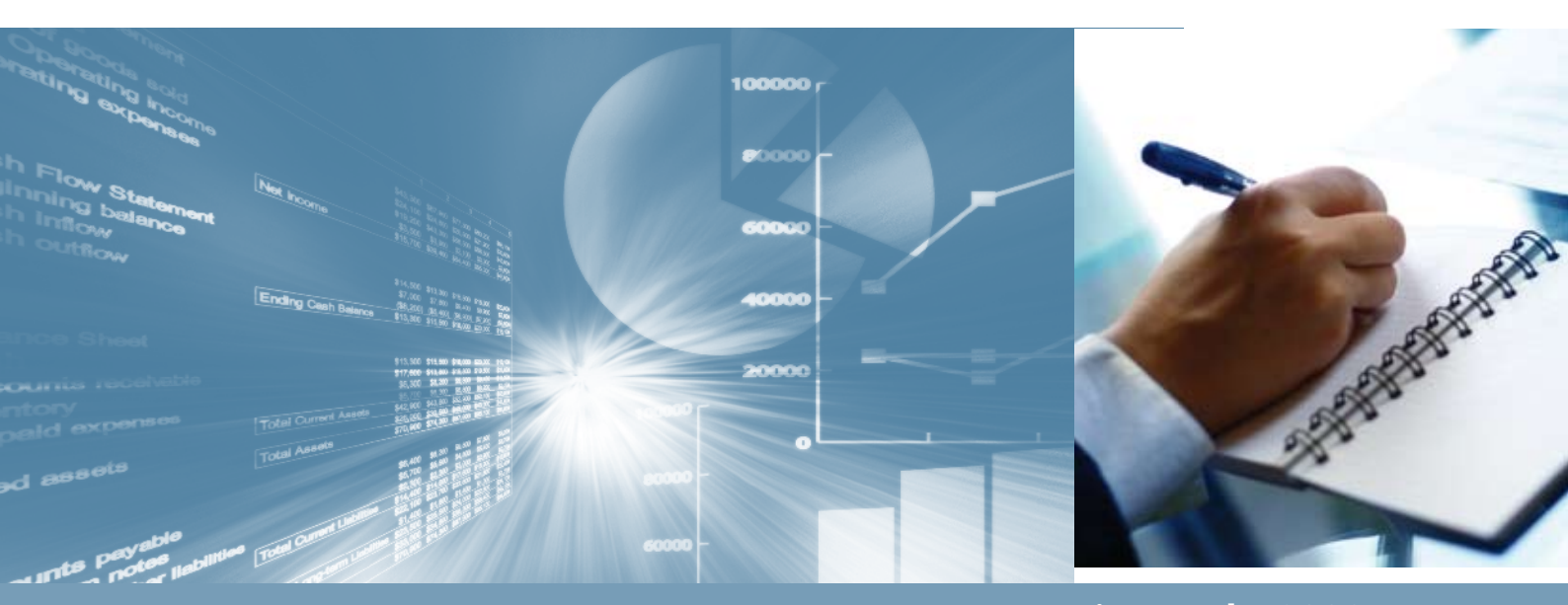
Six Months 2009 Report