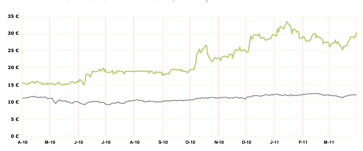
DO & CO Stock in EUR | ATX (Austrian Traded

In the 2010/11 business year, the DO & CO stock price rose by 88.4% from EUR 16.00 to EUR 30.15 at the Vienna Stock Exchange, thus almost repeating its 100% increase of the previous year. The growing price in combination with the Company's capital increase boosted this year's market capitalisation from EUR 122.62 million to EUR 293.78 million.